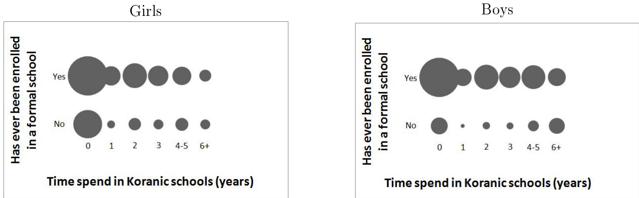
FIGURE 3 – Joint distribution of Formal school access and time spent in Koranic school for boys and girls

face strong credit constraints. Boarding Koranic schools may even have negative costs, as the child is fed by his school through begging.