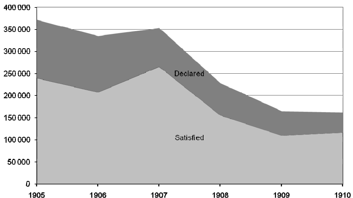
Graph 2. Number of causes of workers complaints in 1905-1910 (declared to satisfied)*

Source: Ob izmenenii shtata fabrichnih inspektorov. SPb., n/y, S.17; Svodi otchetov fabrichnih inspektorov [1900-1914]. SPb., 1902-1915.